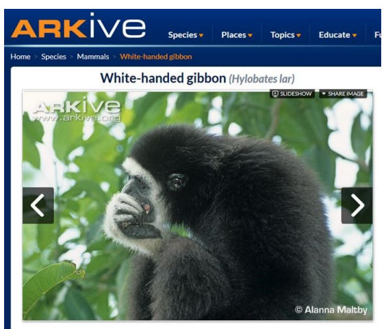
White-handed gibbon feeding

Although humans only have 46 chromosomes whilst apes have 48, many of the individual chromosomes are remarkably similar. It has been shown that the amino acid sequences of human proteins are more than 99% identical to the amino acid sequences of the corresponding proteins in chimpanzees and gorillas.