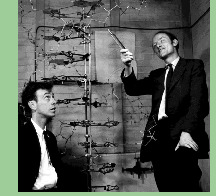
Figure 3: Our understanding of the role of DNA in genetics and the human genome has changed tremendously in the last 60 years.

50 years later - only 10 years ago - another massive breakthrough came along. This was the completion of the Human Genome Project, which set out to identify the 20-25,000 human genes and the sequences of around 3 billion base pairs that make up human DNA. Since this amazing achievement, based on the collaborative work of 20 different research centres in 13 different countries, work on the human genome has gathered pace. Our knowledge and understanding moves forward all the time.