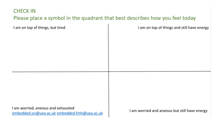
Figure 1. Example check-in slide used at the start of online workshop sessions with students studying on the biology Foundation Year modules at UEA.

through online weekly seminars and VLE-hosted discussion boards. I also engage with their wellbeing challenges by asking students how they are and allowing them to tell me, anonymously (Figure 1). Figures 1 & 2 show examples of how I have responded rapidly to student challenges with each of these being developed the same week that students shared that they were struggling (Figure 1) and feeling overwhelmed with the workload (Figure 2; Edmunds & Gulliver 2021).