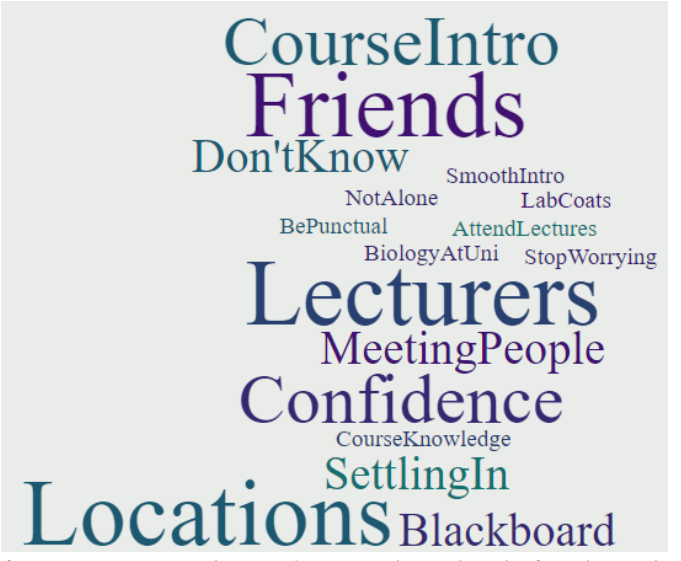
Figure 5. Word cloud of responses given by students in the School of Biological Sciences, UEA, to the question "What was the most important thing that you took away from your introduction to BIO?" (n=169 students).