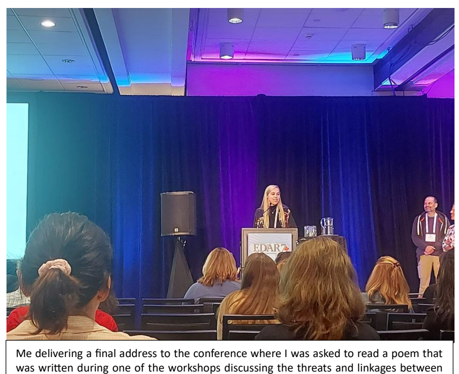
antimicrobial resistance and climate change.