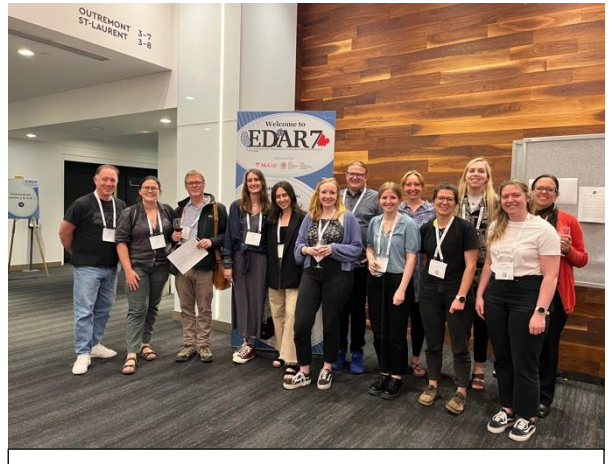
Me (back right) with a group of colleagues and new collaborators at the conference.

Career Advancement : I had the opportunity to discuss postdoctoral opportunities with potential mentors, paving the way for my future career in academia.